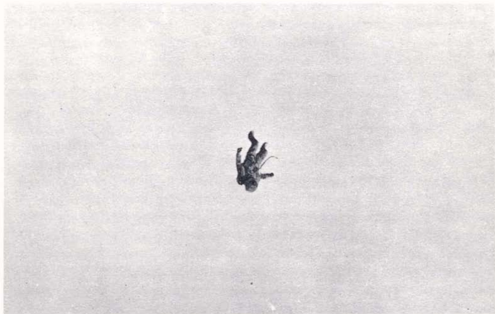
"The Pull," 1976 (detail) Photo Series.

I think this represents a major shift in the way images are used in works of art. The objects or entities used in Goldstein's work have only the emotion read into them, but what's interesting is that this emotion is what we expect them to have in the first place; what happens in the work is congruent with our expectations of how the images would function in our symbolic life if they were allowed to, if they were not restrained by being placed in works of art (culture). Goldstein's work presents these congruencies, these automaticities , as being linked to an undercurrent of sadness because they make us worry about something which is supposedly a positive force in life • spontaneity. A relationship that I will only mention here, but which is important to the cultural meaning of Goldstein's methodology, is the