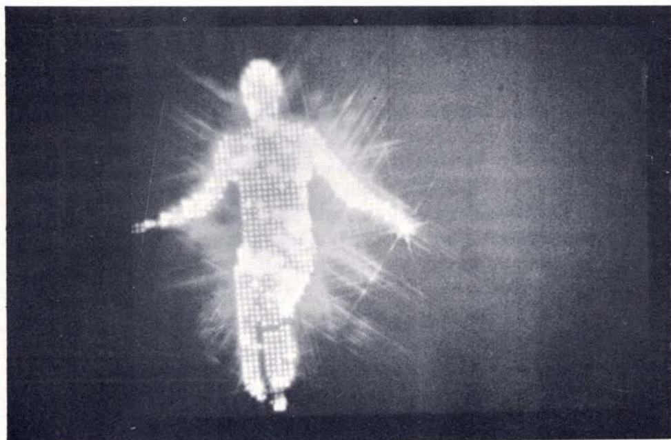
"The Jump," 16 mm Animated Color Film, Silent, 1978

The extreme use of artifice in Goldstein's work and the work of others parallels what literary criticism has dubbed "the rise of the emblematic use of personality"; as if what we seek (identity) is what the configuration of signs in the work suggest. But instead of using the configuration of signs to build a narrative, which would obviate critical integration on the viewer's part, they are crystallized into formations which suggest other, similar signs which have a peculiar character of seeming to signify something but actually refraining to do so. The work, seen in this way, echoes the feeling that we experience life as a series of half-truths. This is the ironic way that art links up with life, through its capacity for meaning removal, and it is also the