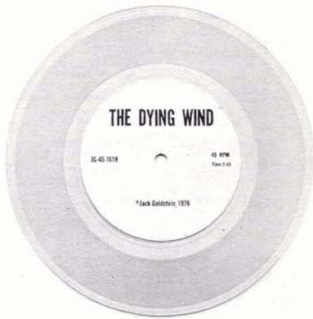
"The Lost Ocean Liner," "The Dying Wind" Sound Effect Series, 45 RPM Records, 1976