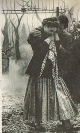
Still from Man Without a World

In Japanese filmmaker Kaizo Hayashi's To Sleep So As To Dream , two modern day detectives become involved in an intricate case that leads them to be unwittingly inserted into an uncompleted silent serial from the past.