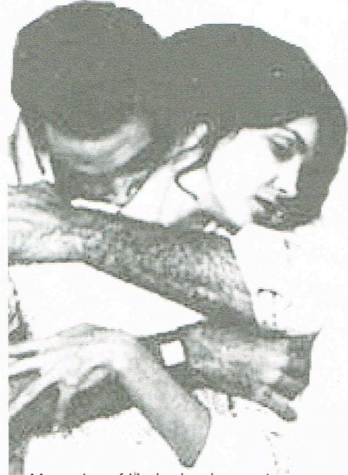
Memories of Underdevelopment