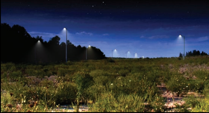
Forest Park , high definition video, 2 channel widescreen 16:9, 2007