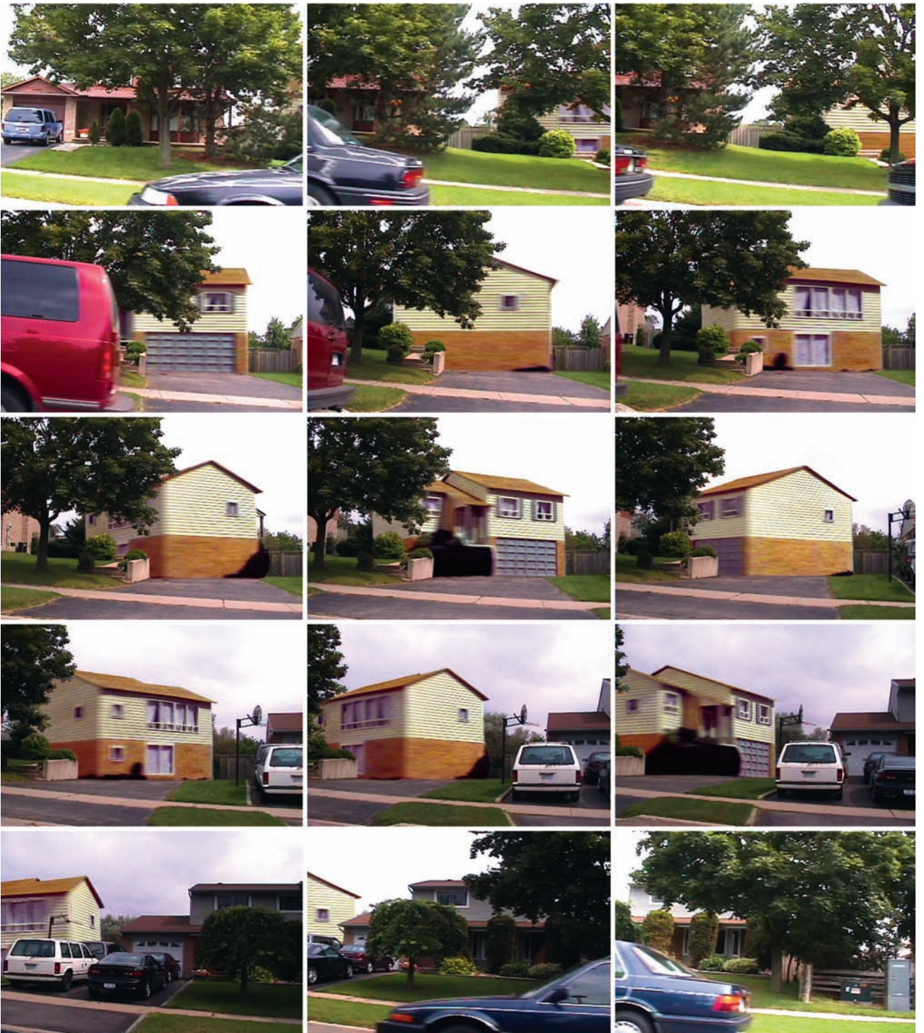
Ferman Drive digital video, 2005