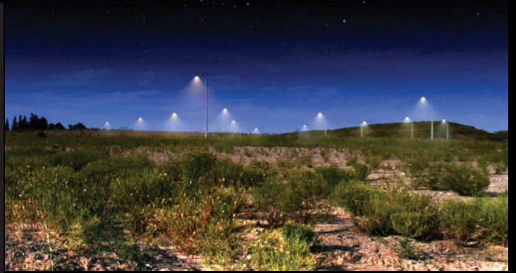
Exiles of the Shattered Star , high definition video, widescreen 16:9, 2001